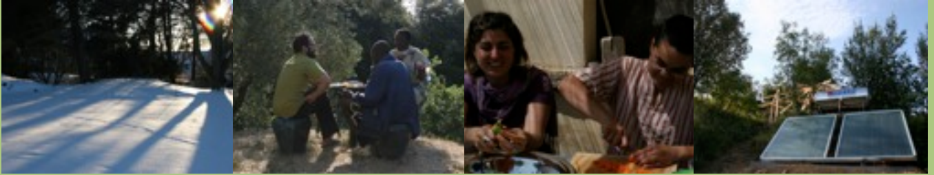
Introduction to the Powers of Place Collaborative